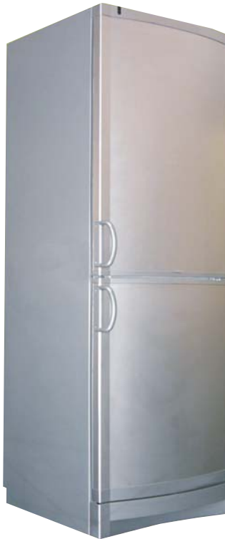
Above : 375 A