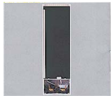
Covered Condenser Built-in Casters for easy positioning