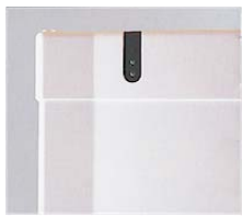
External Indicator Lights