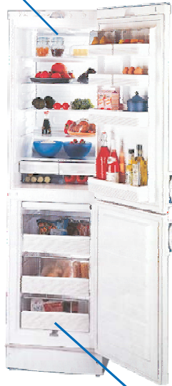
Bottom Mount Freezer