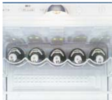
5 Bottle Wine Rack